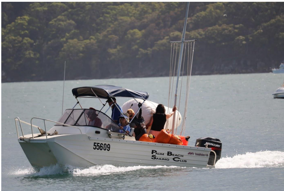
Start boat for Friday and Saturday looks like this